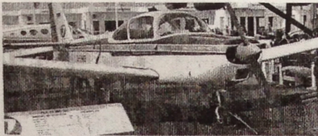
Two rugged trainers with the accent on aerobatic capability. The Fuji FA-200 (above) is making its first Show appearance while the familiar lines of the Zlin 526 (below) have been altered by the introduction of a Lycoming engine